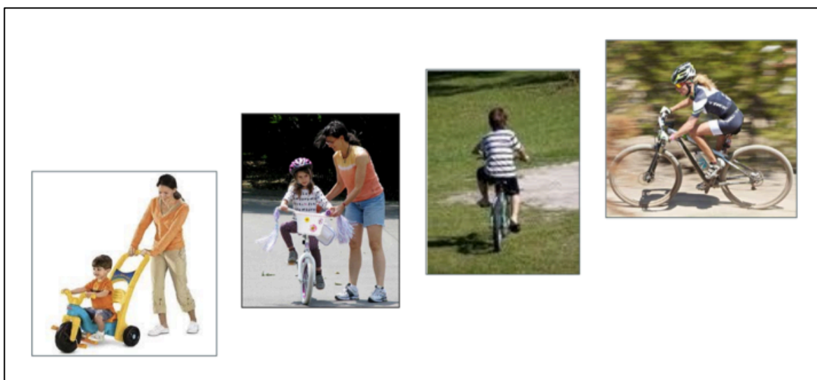
Figure 1. “Learning to ride a bike” as an analogy for presenting the progressively more sophisticated levels of understanding represented in learning progressions.

balance while moving. Finally, the learning progression ends with an experienced rider moving across challenging terrain. For the educators, we posed the question, “What does the rider need to know about riding a bike at each level of this hypothetical learning progression?” In this way, we are able to help the educators consider what big ideas or ‘stepping stones’ would be the most essential for learners (all or most) to learn through targeted instructional intervention over a significant duration of time. We then extrapolated this idea through consideration of the processes by which learners become more sophisticated in their thinking and performances in an area of science content.