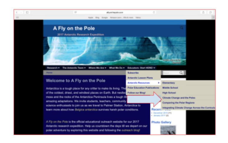
Fig 4: A Screenshot of the 2017 Antarctic Research Expedition Blog Informed by Post-Polar Professional Development Survey Data